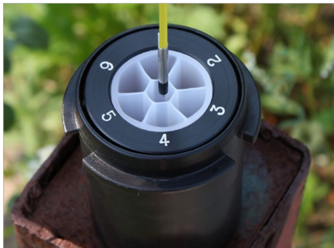
Measure water levels within the narrow channels of a Solinst CMT® System.

The 102M Mini Water Level Meter is available in 25 m and 80 ft lengths. There is the choice of the P4 or P10 Probe.