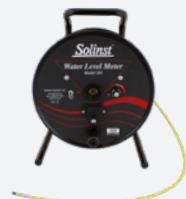
Model 102 Water Level Meter

Vapor Samples: A special Vapor Wellhead Assembly can be used to obtain depth discrete vapor samples.