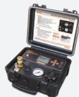
Model 464 Electronic Control Unit