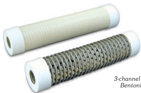
3-channel CMT Sand and Bentonite Cartridges

These cartridges are approximately 2.4" (61 mm) in diameter and will fit inside various direct push drill rods. Ideally, the borehole diameter these bentonite cartridges are used in should not exceed a nominal 3.5" (90 mm), to ensure proper expansion and sealing.