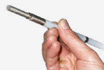
Model 408M DVP 3/8" (9.5 mm)