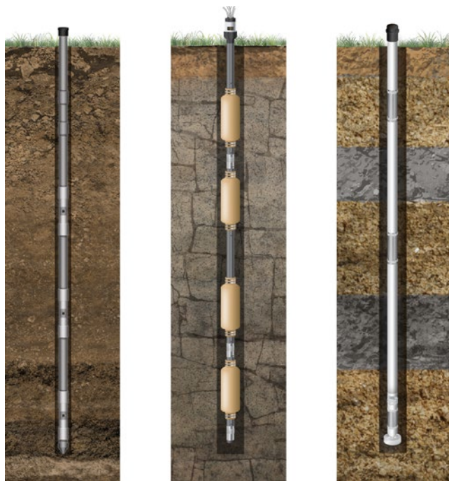
615ML Multilevel Drive-Point Piezometer

Saves Cost – through reduced permitting and drilling costs; and because narrow tubes allow smaller purge volumes, reduced disposal costs, efficient low flow sampling and rapid response to pressure changes, all reduce field time.