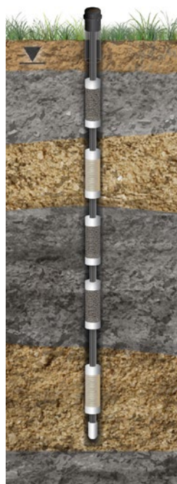
Typical 3-Channel CMT Installation in Overburden with Bentonite and Sand Cartridges