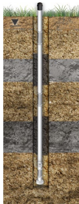
Typical 3 or 7-Channel CMT Installation using Layers of Bentonite and Sand Backfilled from Surface