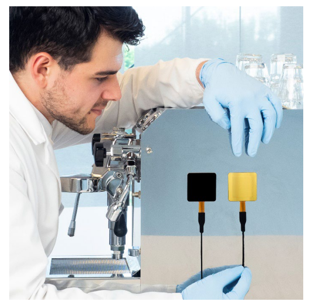
Figure 2 measuring with BLK – GLD stickers; application of a BLK black sticker and a GLD gold sticker on a FHF-type sensor for measuring radiative and convective heat flux