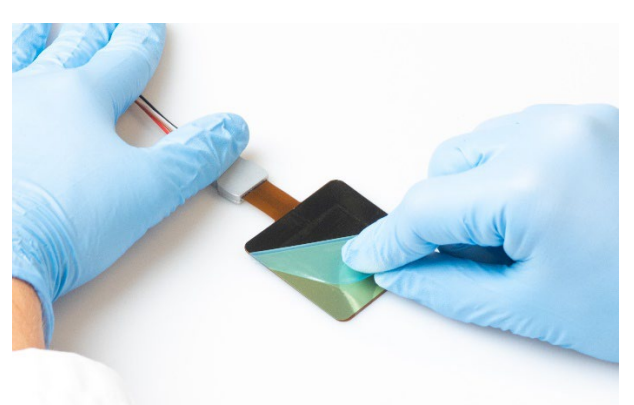
Figure 5 BLK - GLD sticker series are designed to be easily applied by the user. Pre-application to the sensor of your choice at the factory is optional