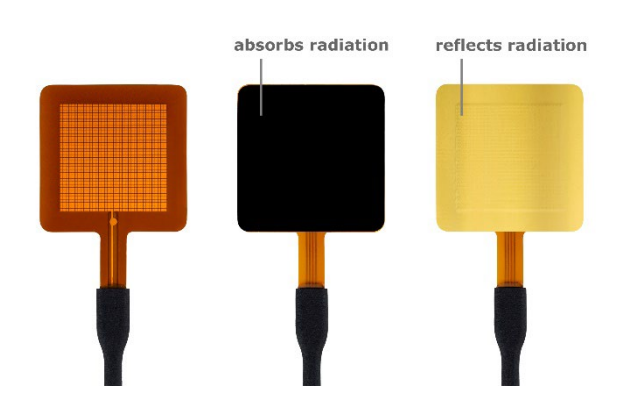
Figure 3 example: FHF05-50X50 foil heat flux sensor without and with BLK-50X50 and GLD-50X50 stickers applied to it