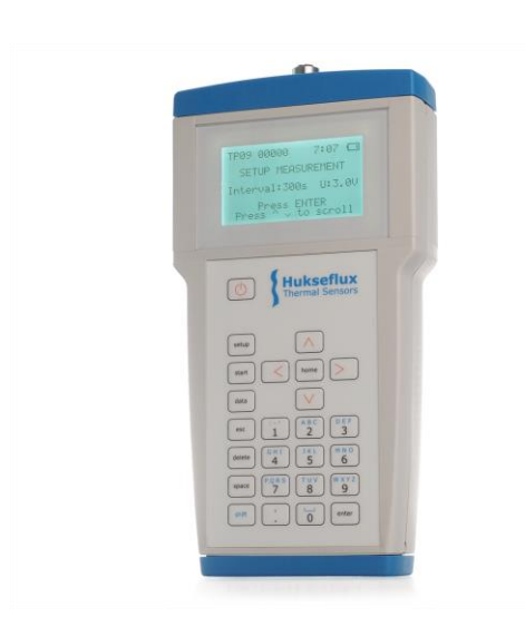
Figure 4 FTN02: CRU02 control and read out unit