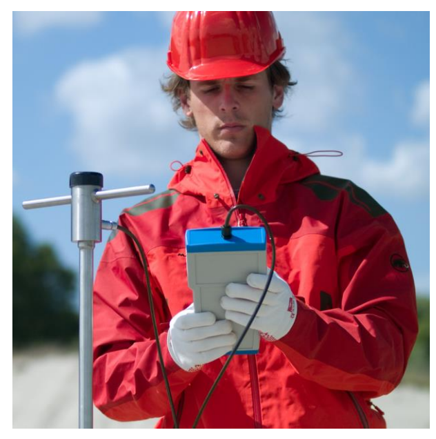
Figure 2 FTN02 being used in an on-site (field) survey

FTN02 is a thermal needle measuring system for on-site measurements of thermal conductivity (or the inverse value, resistivity) at depths from the surface down to a depth of 1.5 metre. Due to its robustness and length, FTN02 is the best solution for route-surveying of high-voltage electric power cables and heated pipelines (typical depth of burial of 1.5 m). The measurement method is based on the use of a "thermal needle". This method employs a heating wire and a temperature sensor in a needle. The FTN02 system consists of the thermal needle, model TP09, mounted on a long lance, LN02, and a control and readout unit CRU02. FTN02 is easy to use. After making a small-diameter access hole, the thermal needle TP09 is brought down to just above the point that must be investigated and then pushed into the local undisturbed soil below. The user performs control and readout of the measurement from the handheld CRU02.