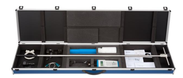
Figure 5 The complete FTN02 system: FTN02 includes one spare sensor TP09, adapters for charging the system in the office, WSA02, and in an automobile, CA02. Also included are communication software and a jar for glycerol. Glycerol must be purchased locally.