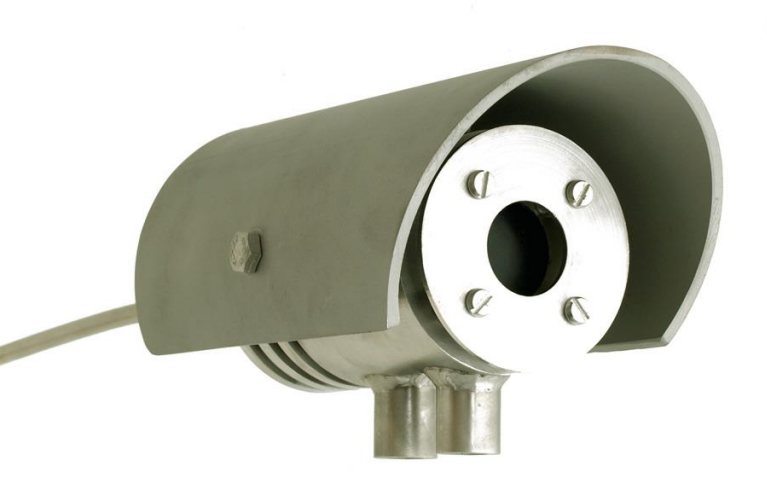
Figure 1 HF02 flare radiation monitor / heat flux sensor

HF02 is a sensor that measures radiant heat flux or thermal radiation in the outdoor environment. A common application is monitoring the radiation emitted by flares. HF02 is certified for use in potentially explosive atmospheres, and is rated for radiation levels up to 15 \times 10^3 W/m². We recommend use of HF02 in a decision-supporting role only, and not to use measurements of HF02 as the main or sole source of information for judging safety.