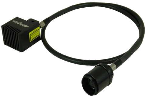
Collimator with light guide and GCS source