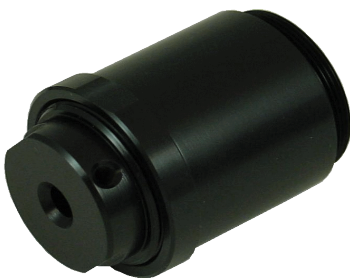
Light guide collimator

The full field of view (FOV) or full divergence angle can be calculated as FOV = 2\arctan(D/2f) , where D is the light guide core diameter and f is the focal length of the lens. Alternatively, the linear field of view on an object placed at a distance L away from the collimator is D(L/f) .