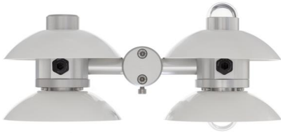
Figure 4 NR01 4-component net radiometer, including two pyranometers, two pyrgeometers, heater and 2-axis levelling assembly (mounting tube not included)