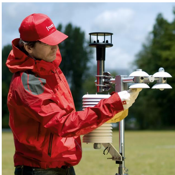
Figure 2 NR01 in use in a typical meteorological station