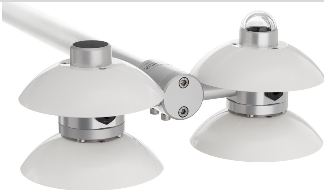
Figure 1 NR01 4-component net radiometer

NR01 is a market leading 4-component net radiation sensor, mostly used in scientific-grade energy balance and surface flux studies. It offers 4 separate measurements of global and reflected solar and downwelling and upwelling longwave radiation, using 2 sensors facing up and 2 facing down. NR01 owes its popularity to its excellent price / performance ratio. Advantages include its modular design with 2 pairs of identical sensors, low weight, ease of levelling, and low solar offsets in the longwave measurement. The unique capability to heat the pyrgeometers reduces measurement errors caused by dew deposition.