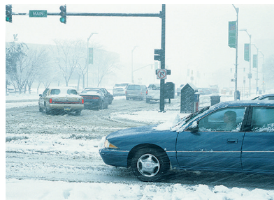
PWD sensors can be used in planning road maintenance.

With a measurement range of 10 ... 20 000 meters, PWD20 offers long-range visibility measurement for diverse applications covering harbors, coastal areas, heliports, windmill parks – indeed, any locations or areas where visibility measurement is necessary.