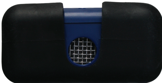
Ruggedized boot and Stand Included