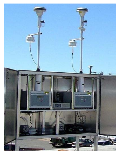
Optional BX-906 Dual-Unit Shelter