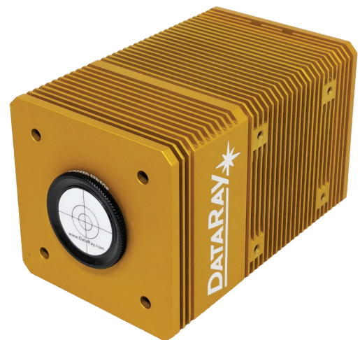
WinCamD-QD 2.4 x 2.4 x 3.9 in 66 x 66 x 99 mm