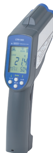
Infrared hand-held thermometer model CTR1000