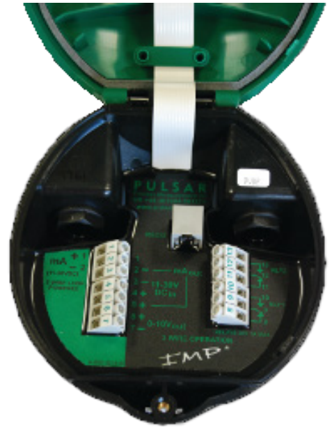
Inside the lid of an IMP Lite