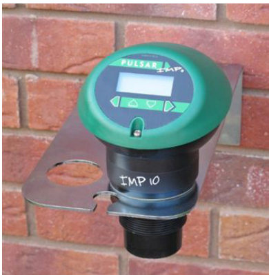
Optional mounting bracket for IMP sensors