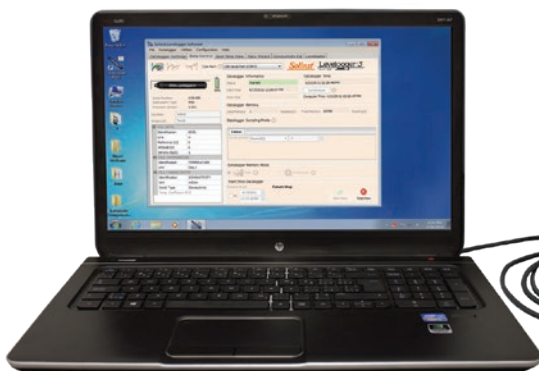
PC Interface Cable