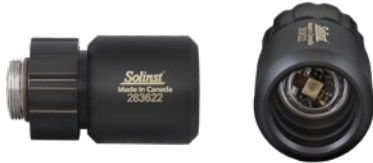
L5 Slip Fit Adaptor (#114598)