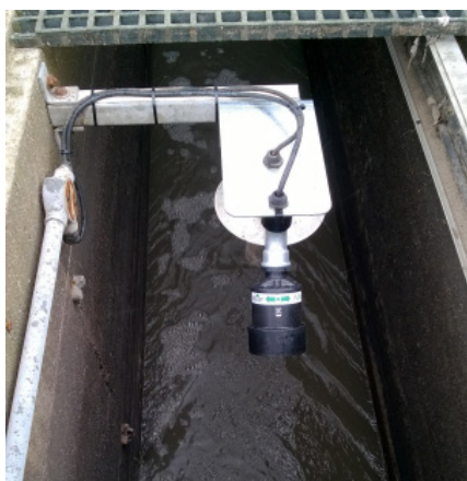
MicroFlow and dBMACH3