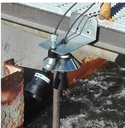
MicroFlow and dBMACH3 in a wastewater application

Thanks to Pulsar Measurement's award-winning and world-leading non-contacting technology, the MicroFlow sensor range does not include any serviceable parts and because it makes no contact with the application, there are no wear and tear issues.