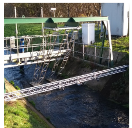
3 MicroFlow's on a wide channel