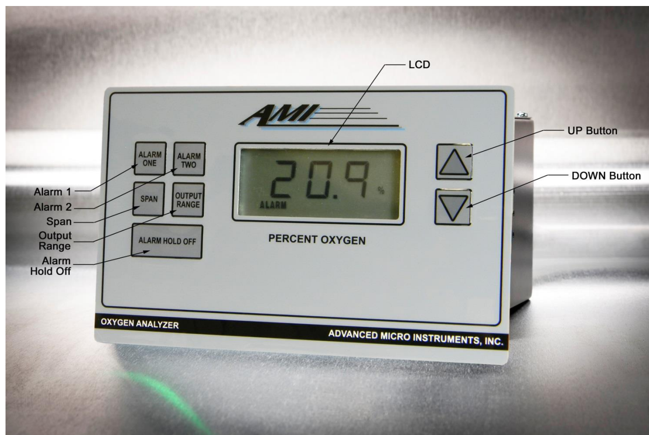
Figure 2. The 70R1

Since this analyzer does not contain a replaceable sensor, only electronic controls are visible on the front panel.