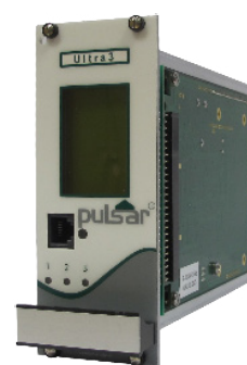
Ultra 5 Rack Mount Unit