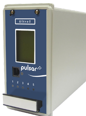
Ultra 5 Panel Mount Unit