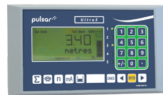
Ultra 5 Fascia Unit