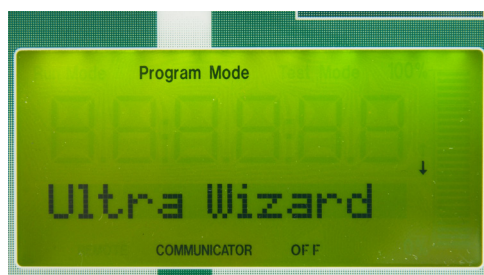
Ultra Wizard on-board, menu-driven software