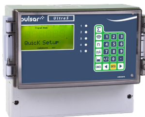
Ultra 5 Wall Unit

A data-logging board is an optional extra with an RS485 connection and large data log capability together with Profibus DP V0 and V1 or Modbus RTU communications.